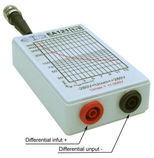
Fig. 1.1. – Front panel connectors

The layout of the front and rear panels are shown on figures 1.1 and 1.2.