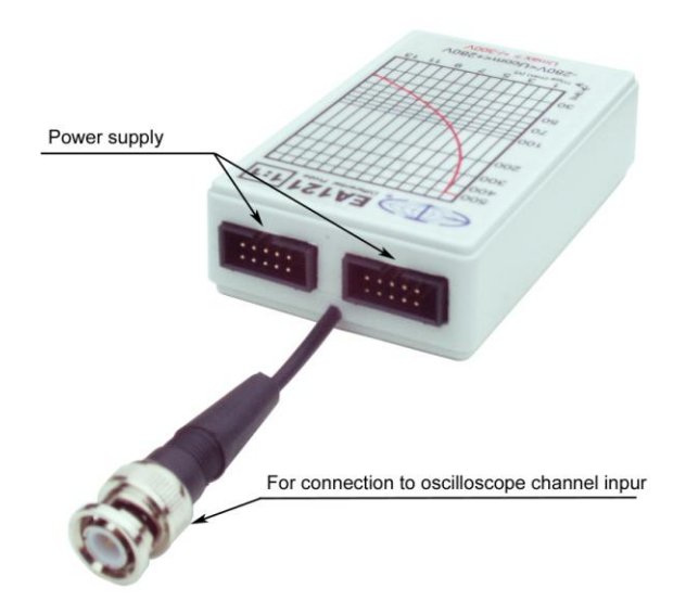
Fig. 1.2. – Rear panel connectors

When installing the probe you can face to one of two possible situations.